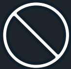
Trespassing & Loitering